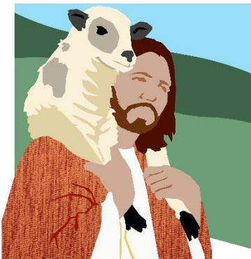
Rescuing the Wanderers