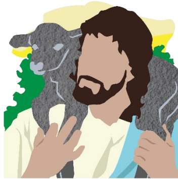
A Very Good Shepherd