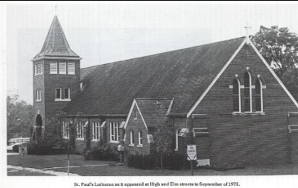
St. Paul's Lutheran as it appeared at High and Elm streets in September of 1975.